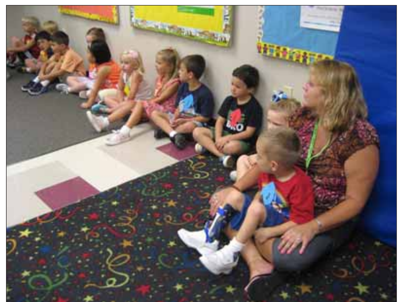
St. Peter's offers two weeks of fun and learning through Sunny Days for children ages 2 to 5. This past week they explored oceans and next week will feature storybook classics.