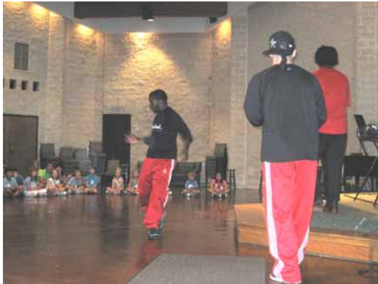
Children attending Camp St. Peter's this week were treated to a break-dancing demonstration. Camp St. Peter's continues next week for first-through fifth-graders. This year they are learning about heroes in the Bible and in their lives and how they can be heroes.

MONDAY Psalm 25:1-21 TUESDAY Luke 12:35-40 WEDNESDAY Micah 7 THURSDAY Colossians 3:12-17 FRIDAY Luke 8:11-15 SATURDAY James 5:7-11 SUNDAY Psalm 103:1-13 MONDAY Psalm 44:1-8 TUESDAY Isaiah 41:1-10 WEDNESDAY Hebrews 10:19-25 THURSDAY Revelation 21:1-8 FRIDAY 1 Corinthians 1:9 SATURDAY Hebrews 6:13-20 SUNDAY Psalm 105:1-11